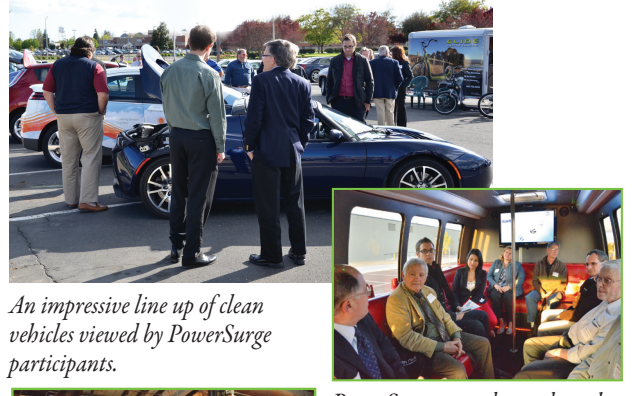
PowerSurge attendees rode to the RETC in "Rocky the Rockstar Limo"