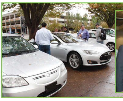
Alternative vehicle display which included the new Tesla S, seen for the first time in Sacramento.